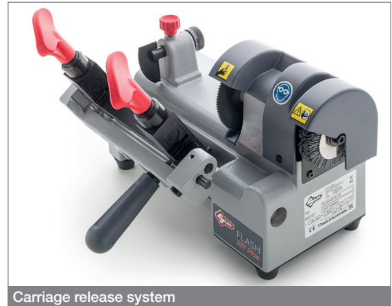
Carriage release system

Flash Bit Plus is equipped with a tracer point adjustment system for fast, precise calibration.