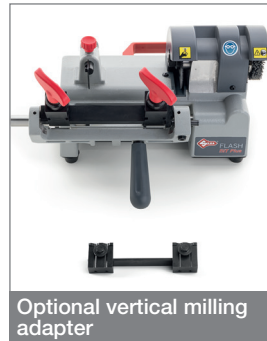
Optional vertical milling adaptor

The three-sided revolving clamps feature a special blocking system for Abus* and Abloy* type keys. Locksmiths can benefit from a selection of optionals to widen the range of keys cut including the vertical milling adaptor.