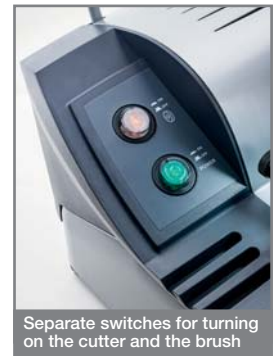
Separate switches for turning on the cutter and the brush

The on-off switch features a safety cut-out for user protection. The machine needs to be manually re-started after a power interruption. The carriage cannot be released until the gauges have been disengaged for avoiding accidental damage.