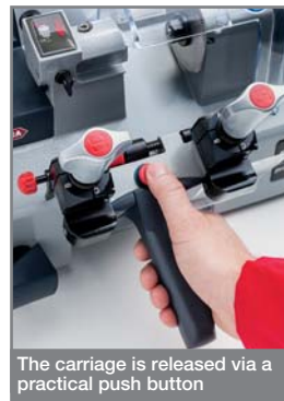
The carriage is released via a practical push button

The machine is equipped with a mechanical tracer point with micrometric adjustment ring nut (+/- 0,05 mm) for an accurate key cutting.