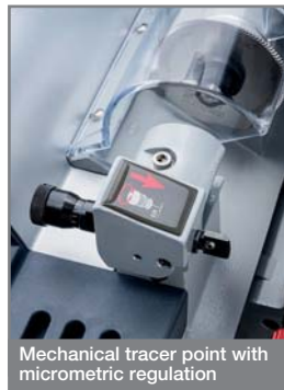
Mechanical tracer point with micrometric regulation

The four-sided clamps accommodate a wide variety of keys and feature an easy-to-rotate system for a quick tool adjustment. The patented dynamometric clamping system with controlled movement knobs ensure perfect key locking. The grip is balanced and secure to avoid damage to the key and to the clamp due to wrong or excessive pressure.