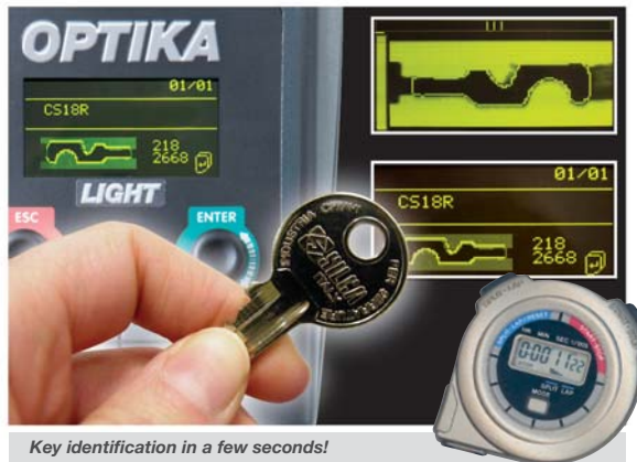
Key identification in a few seconds!